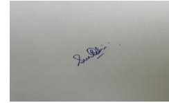
Signature of Faculty Member